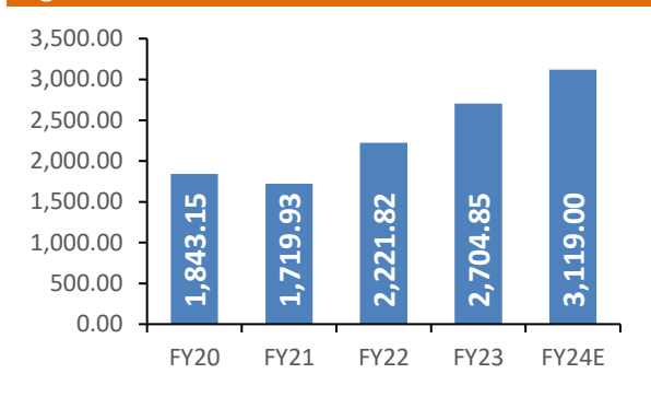
Figure 1: Revenue Trend (Rs. In Crs)